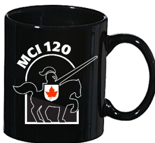
MCI Coffee Mugs: Now $12.00