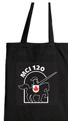
MCI Tote Bags: Now $14.40