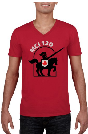
MCI 120 t-shirts: Now $24.00