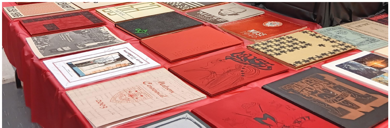
Display at Reunion in 2023 for the 100 th Anniversary of The Malvern Muse – see p. 3.